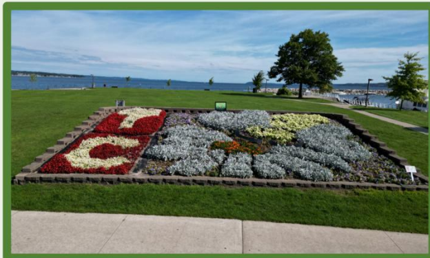
Traverse City Logo Garden