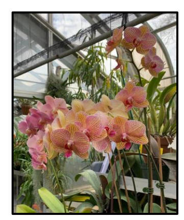
Orchids at Hillwood Estate, Washington, DC