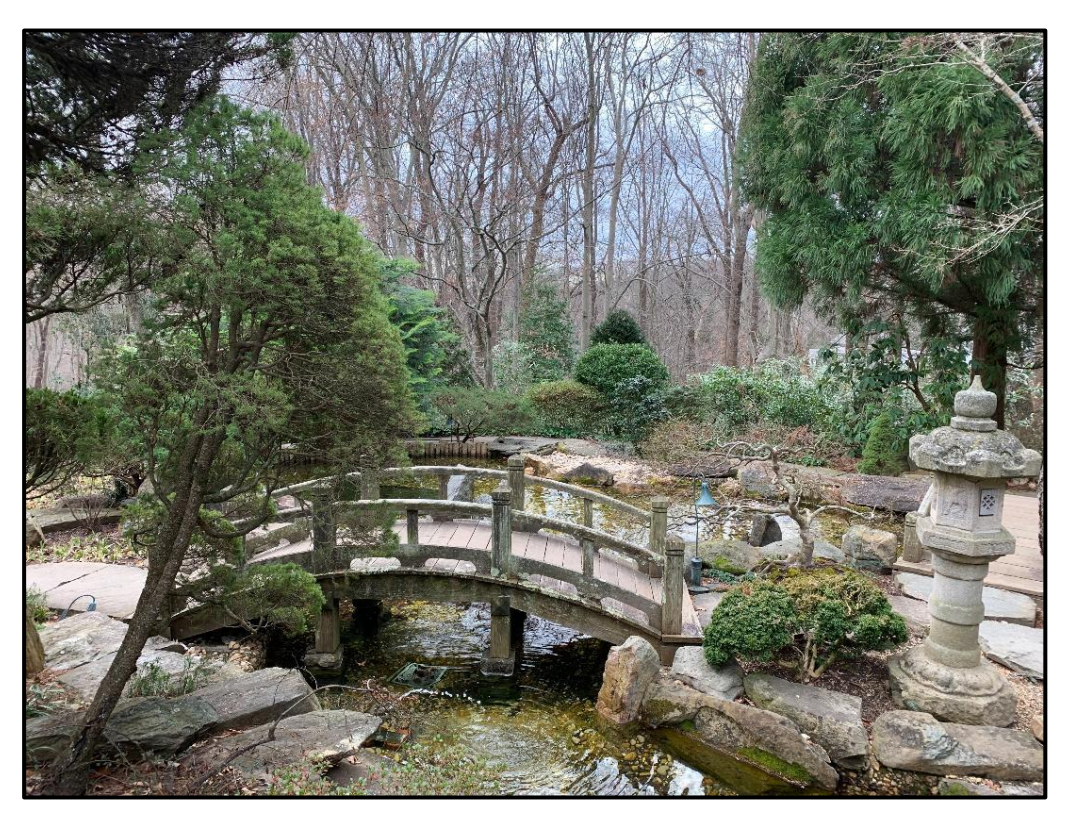
The Japanese-style Garden at Hillwood Estate, Washington, DC