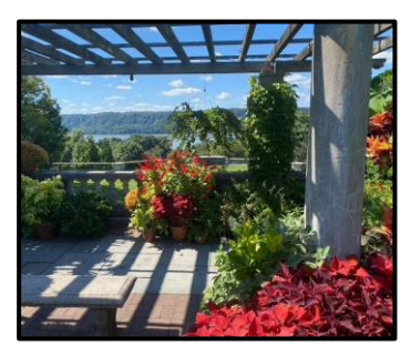
An interesting use of red to keep the eye moving. The shadows add as much interest as the views.