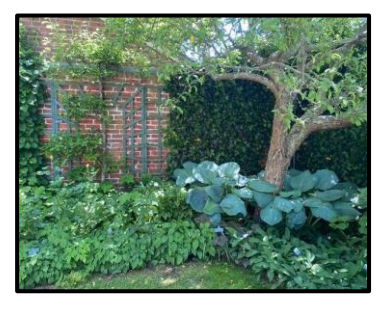
Adding lattice on a wall gives interest and depth to a small backyard.