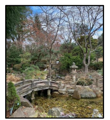
The Japanese-style Garden at Hillwood Estate

receive LD "Consultant" Refresher cards. We were once the LD Study Program, rather than LDS. We've had three curriculum changes during this period and developed online fillable forms, rather than having to photocopy every form from a handbook. There were several LDS handbooks (Operations Guides) and each of the three schools had its own handbook prior to the 2019 implementation of a Common Schools Handbook and new online fillable Common Schools Forms. Most recently, Zoom and Hybrid courses have become alternatives to classroom courses.