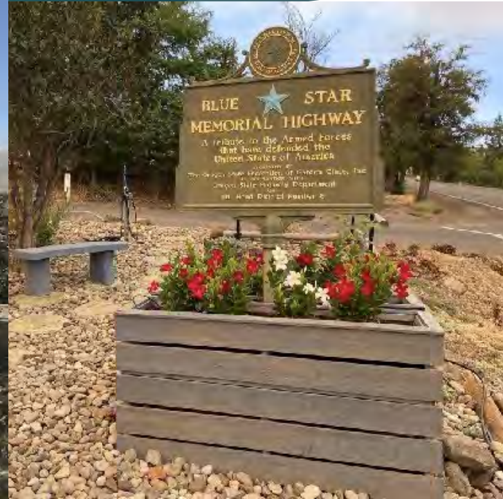
Blue Star Memorial Landscaping