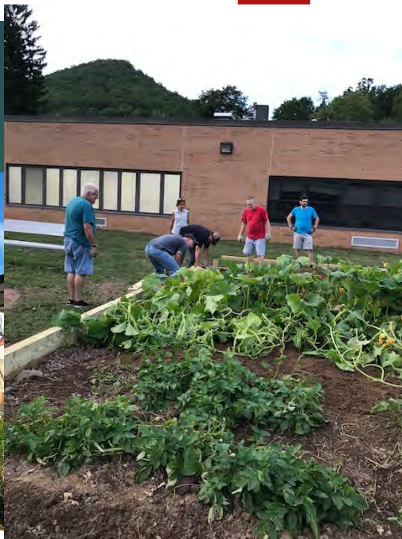
Renewal of Elementary School Garden