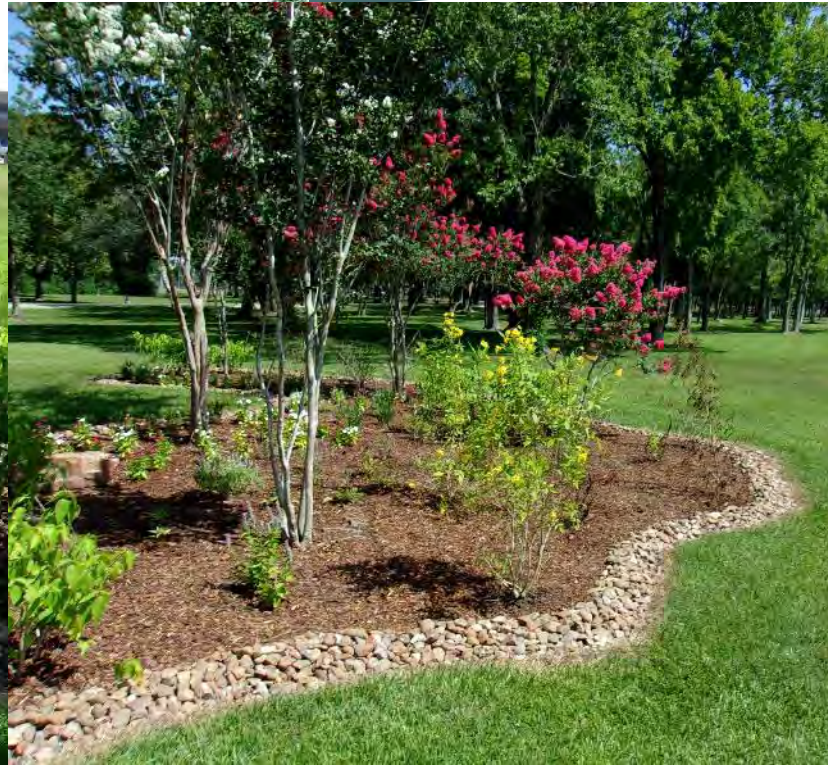
Dickey Park Monarch Butterfly Waystation