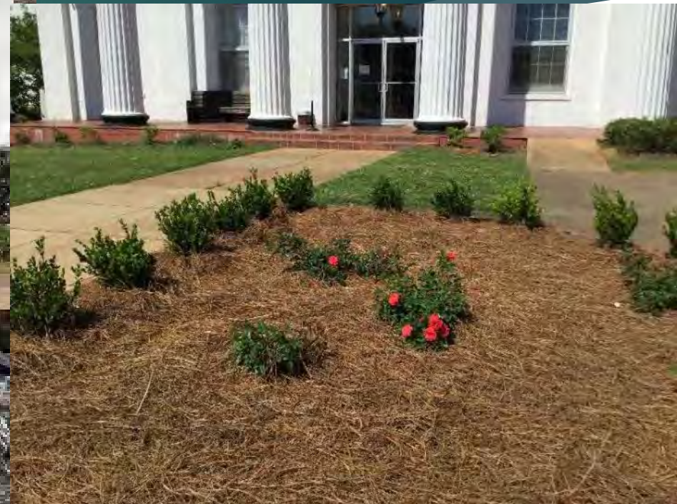
Coretta Scott King Rose Garden