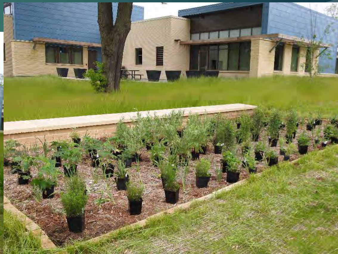
Midtown Police District Garden