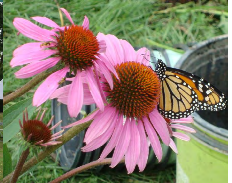
Pollinator Garden at Oak Bluff Cemetery