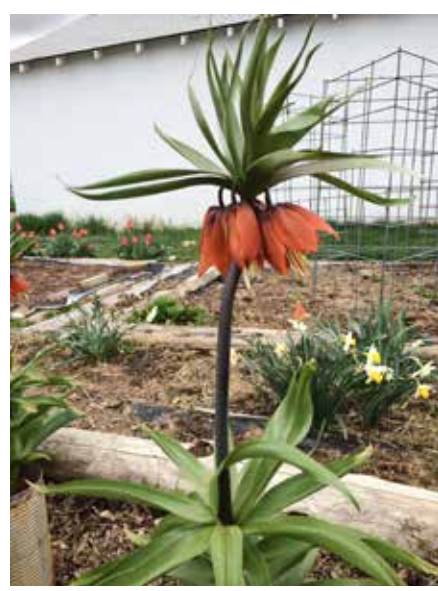
▲ TOP: Dinosaur Kale BOTTOM: Crown Imperial