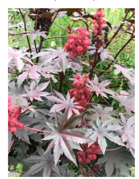
Red leaf castor bean

perfect pumpkin in shape, but a reasonable facsimile, and is great for autumn decor!