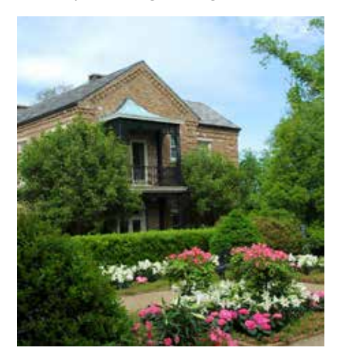
TOUR B "The Crosby Arboretum" - $65 9:30 a.m. - 4 p.m.