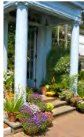
Wave Hill, Bronx NY.