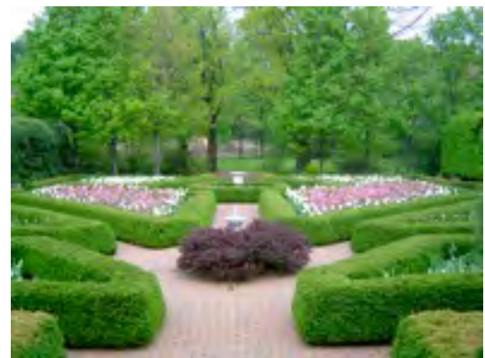
Top two: New York Botanical Gardens; Bronx, NY; Boerner Botanical Gardens, Milwaukee, WI; Kingwood, Mansfield, OH.