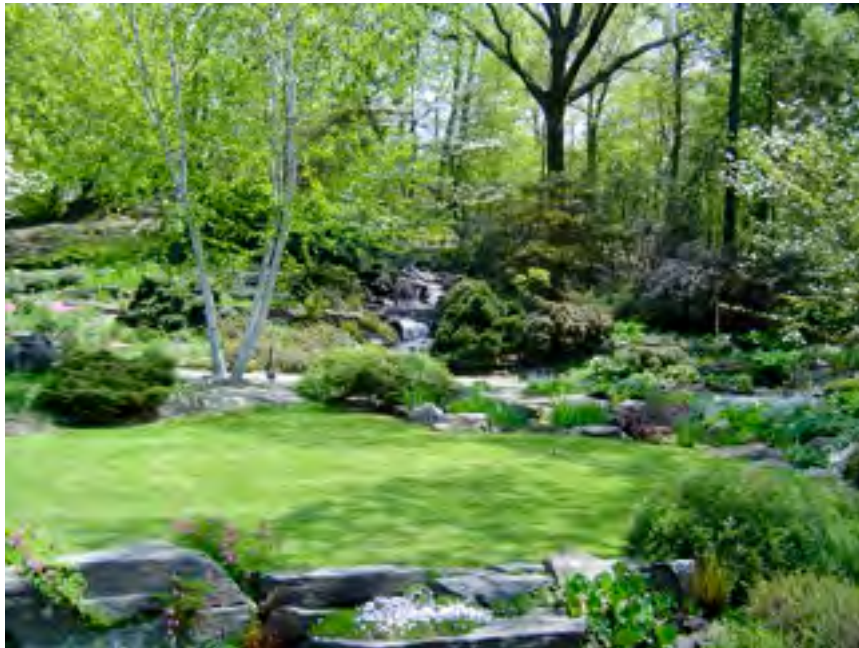
The Rock Garden at New York Botanical Garden. More spring garden photos inside! Photo below: Vizcaya, Miami, FL.