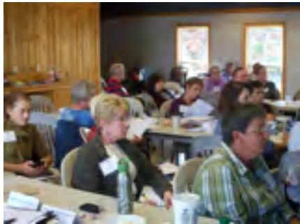
Ohio LDS, Mason, OH.