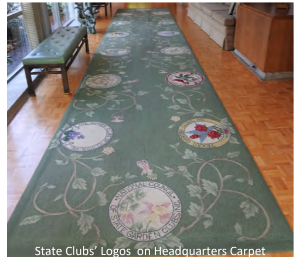
State Clubs' Logos on Headquarters Carpet

Editor's Note: Thank you to all of our dedicated NGC staff for taking time out of their very busy days to share a bit of themselves with all of you. They are a great source of help and information and we are so very lucky to have their support.