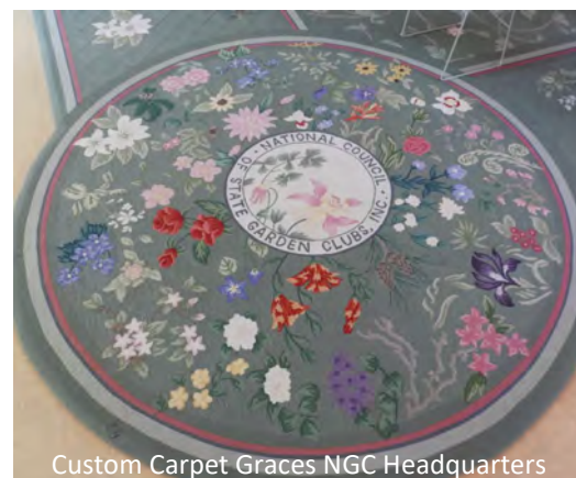
Custom Carpet Graces NGC Headquarters