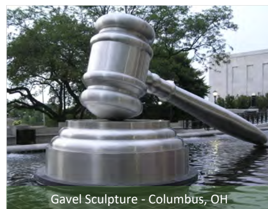
Gavel Sculpture - Columbus, OH