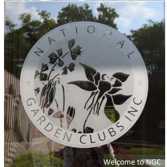
Welcome to NGC