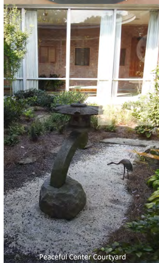
Peaceful Center Courtyard