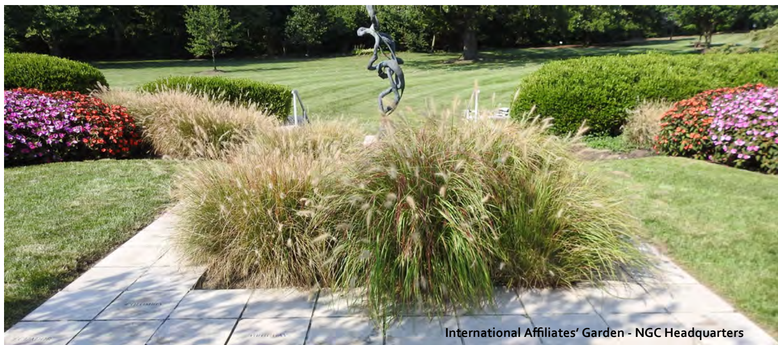
International Affiliates' Garden - NGC Headquarters