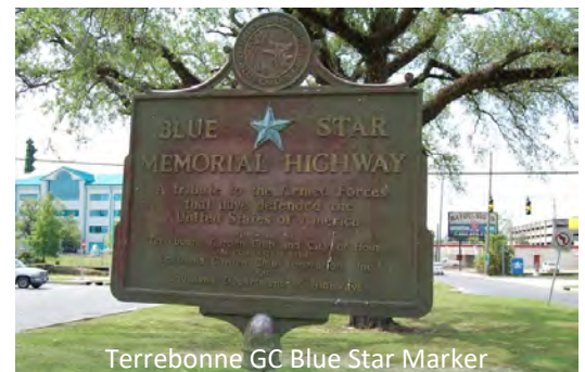
Terrebonne GC Blue Star Marker

Welcome to Terrebonne GC's 90 th Birthday