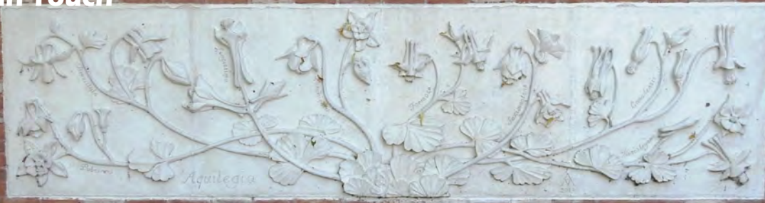
Wall Sculpture of Columbine Species From Every State