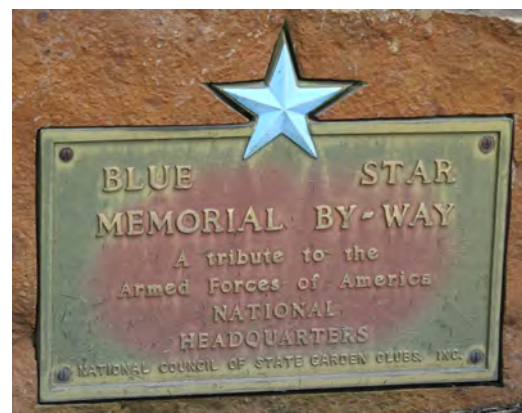
Welcome Wall - NGC Headquarters