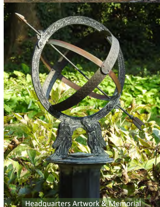
Headquarters Artwork & Memorial