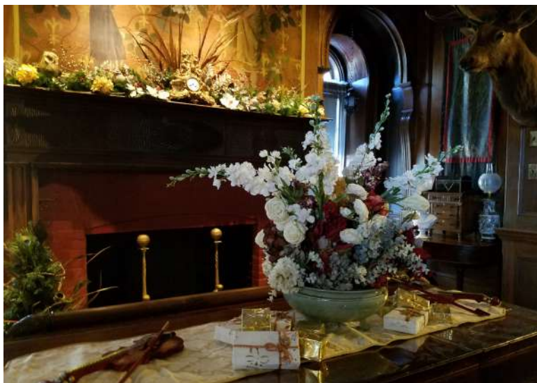
The Milford Garden Club decorates Grey Towers, located in Milford, Pennsylvania. It was originally the summer estate of the James Pinchot family and later the primary home of Gifford Pinchot, America's first forester and founder of the USDA Forest Service and two-time Governor of Pennsylvania.