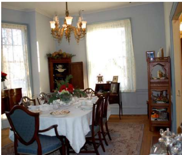
The Southern Butler County Garden Club had the wonderful opportunity to decorate two historical homes, the Buhl House and Passavant House, located on Main Street in downtown Zelienople, Pennsylvania. The Passavant House (pictured immediately left) was decorated in period décor with fresh fruit & greens. The Buhl House interior was themed after an old time Department Store, with each room a specific department. The “toy department” room with old fashioned décor and antique toys is pictured on the upper left, and the living room is above. More pictures of the Christmas house tour and other events are on their website, www.southernbutlercountygardenclub.org .