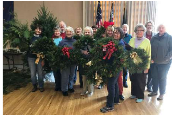
The Home Garden Club of Morristown, New Jersey display their handmade wreaths before donating them to adorn the doors of historical landmarks in town. The greens are donated by the Freylinghuysen Arboretum.