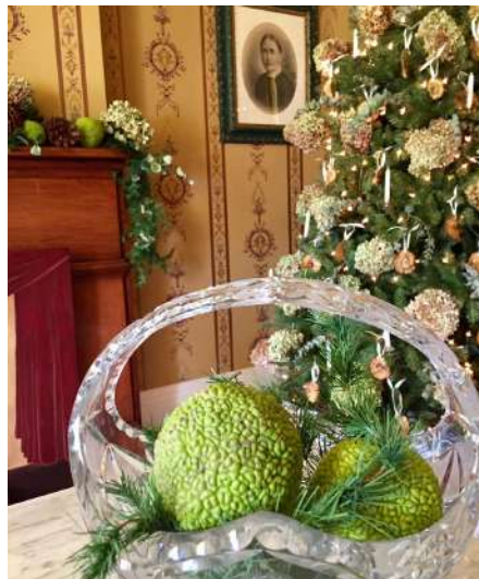
The Muirfield Village Garden Club, Dublin, Ohio was asked to decorate the Coffman Homestead, which was built between 1862 and 1867 and is on the National Register of Historical Buildings. In keeping with the time period, the family parlor was decorated using Osage orange fruit both live and dried, dried hydrangea, pine cones and greens. The welcoming centerpiece on the right features greens, apples and a pineapple.