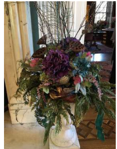
Garden Club of New Jersey volunteers decorate the Drumthwacket mansion annually in holiday finery. Members from the Belvidere, Essex Fells, Keyport, Mountain Lakes, Stony Brook, and West Trenton Garden Clubs participate. Drumthwacket is a Scots-Gaelic name meaning "wooded hill." It is now the official home of the Governor of New Jersey.