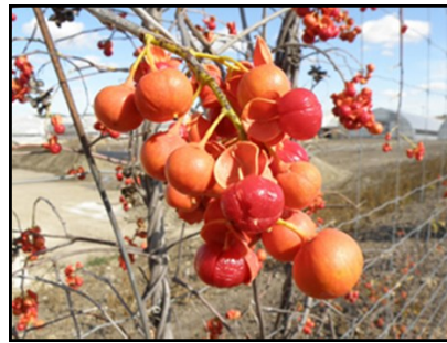
American bittersweet fruit capsules are orange

The invasive form of bittersweet is similar to the native variety, but there are significant differences. American bittersweet is a compact vine that produces orange fruits and capsules at the end of a stem. Oriental bittersweet also produces orange fruits, but the capsules are yellow and scattered along the stem. The plant can take root wherever it touches the ground or if birds eat the fruits and spread the seeds; either method of propagation can produce 66 foot long vines that can smother trees. Infestations are difficult to eradicate because of the ease with which the non-native species grows and spreads. Simply cutting the vine and brushing the stump with herbicide does not always work; both ends of the plant must be treated. Oriental bittersweet out-competes the native species to the extent that American bittersweet may become extinct in some parts of the United States.