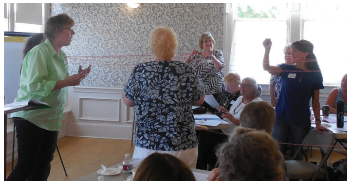
Workshops in Oregon and Washington.

these entertaining and informative forums, but have not had one in your state, visit an upcoming seminar in New Mexico or Oklahoma by contacting the State President (or District Director) to see about attending. Ask your state officers to bring a Leap into Leadership Committee member to your next meeting. Bring a friend, and share the travel expenses!