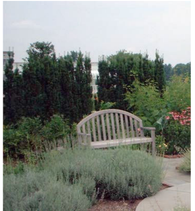
Late summer 2011, the yew hedge separates the healing garden from the rest of the park. The lavender and purple coneflowers surrounding the bench create a tranquil and fragrant spot for park visitors to sit and reflect.