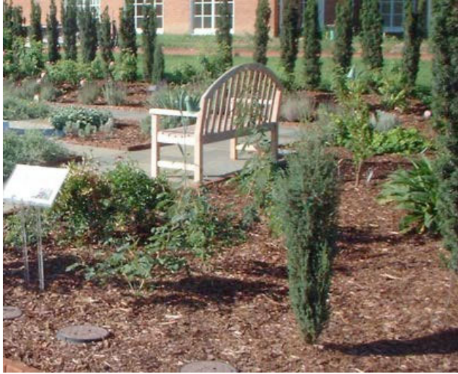
In early summer 2011, the herbs are beginning to fill in around the bench. The pavers weave their way through the garden and signage is placed to identify the plants and their medicinal use.