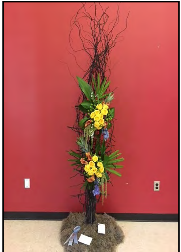
Table Artistry Award # 1

Division II, Section B “Southern Hospitality”