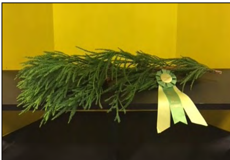
Arboreal Award Division I, Section F “Arbor Day” Class 71 Arboreal Cryptomeria japonica ‘Yoshino’