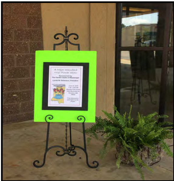
Entrance to complex with welcome sign and iron coffee cup with fern