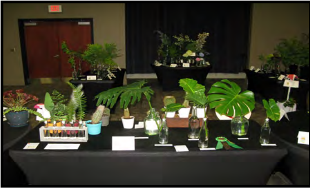
Examples of overall Horticulture Staging