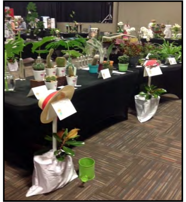
Rectangular tables covered with black cloths were used to stage Education Exhibits