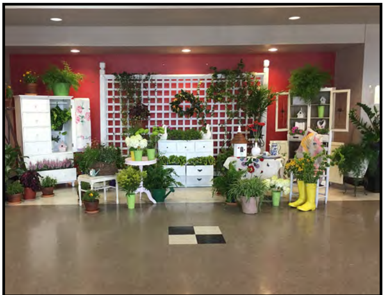
Gardening vignette welcomed guests