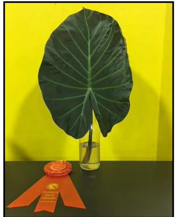
Award of Merit Division I, Section E “Habitat For Humanity” Class 49 Foliage Perennials Colocasia ‘Black Magic’