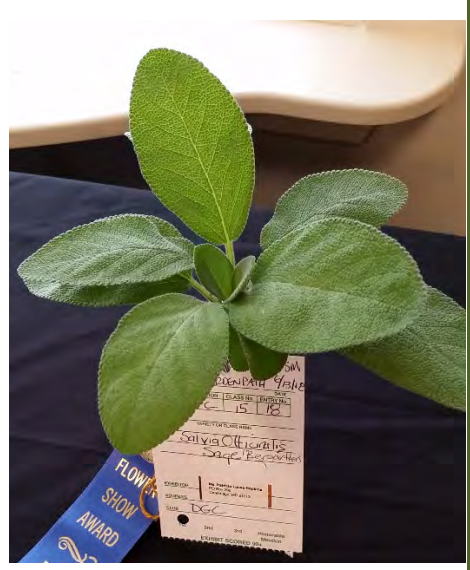
Above: Salvia officinalis 'Berggarten' Section C "Indulge the Senses" Herbs Class 15 Salvia – three stems