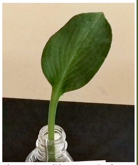
Above: Hosta 'Blue Mouse Ears' Section B "Cool Green Shade" Hosta Class 6b: Small Solid Green -one stem