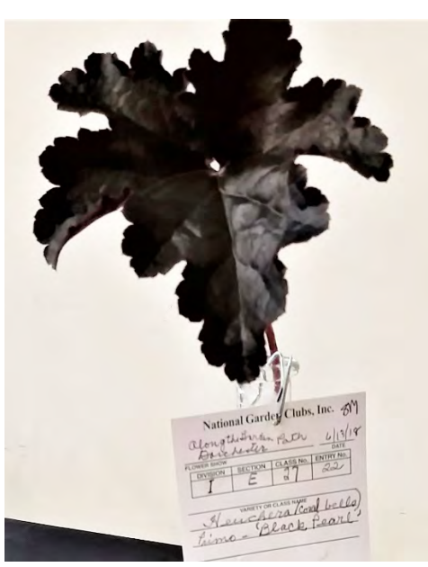
Above: Heuchera 'Black Pearl' Section E, Class 27 Heuchera