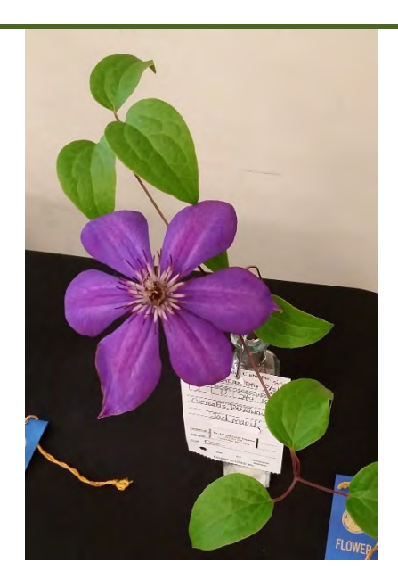
Above: Clematis ranunculaceae Section D, Class 24 a Any other flowering perennial in bloom. Section subdivided to – section a, purple blooms.