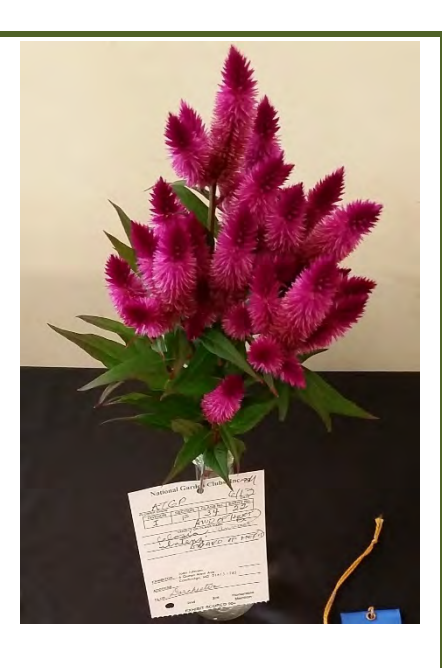
Above : Celosia 'Intenz' Section F, Class 34 any other annual in bloom.