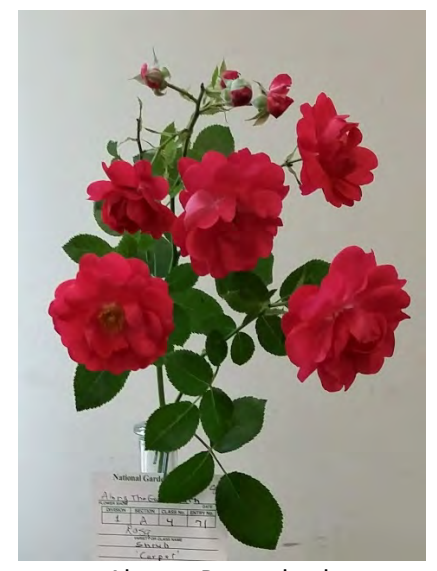
Above: Rosa -shrub Section A "Rainbow of Color" Rosa Class 4: Shrub – one spray