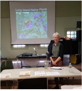
Instructors lectured on botany and native plants.

The course covered topics of Basic Botany, Soils, Techniques for Growing Outdoor Flowers and Plant Propagation, as well as Reconciliation Ecology. There also was an emphasis on gardening to protect and enhance our native environment to help our club members "Plant America" thoughtfully and responsibly. Attendees learned about the effects—both positive and negative—of fertilizer applications and climate