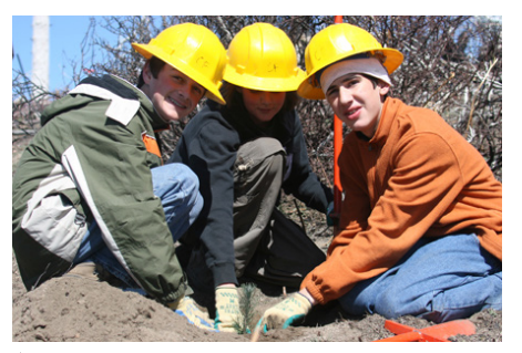
A Penny Pines youth plantation project

using your donation together with federal funds and offers the plantation the same protection from fires, insects and disease provided to other forested areas.