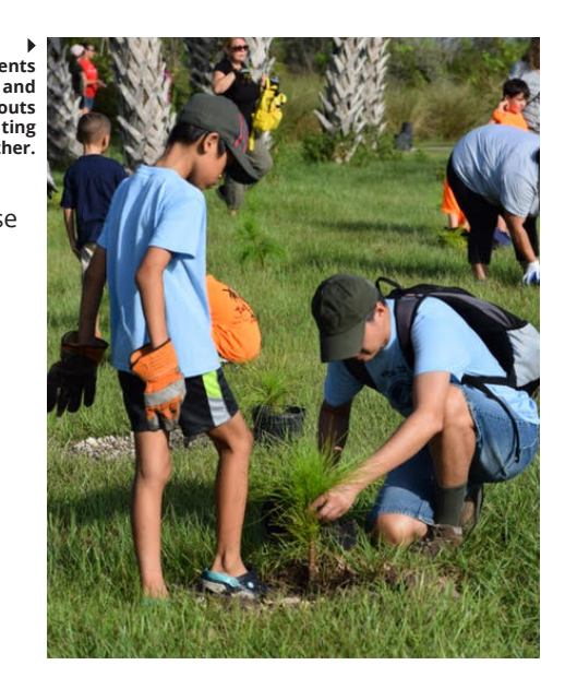
▼ LEFT: Cardinal shrub. RIGHT: Slash pine seedlings.