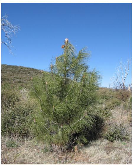
A young tree, planted as a seedling with the help of Penny Pines funding, grows on Mount Laguna.