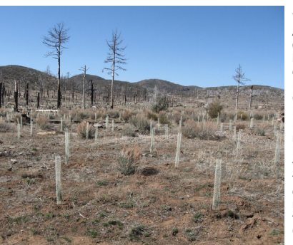
Areas damaged by wildfire on Mount Laguna in Cleveland National Forest near San Diego. The forest is the southernmost national forest in California.