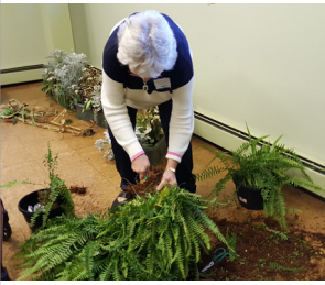
At a plant propagation workshop, an instructor provided plants that students could divide and take home to plant in their home