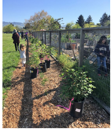
▲ "Planting Party" volunteers matched and placed 55 plants according to the design plan.

Deanna Statler, project chairman, assembled a committee to research plants that would require full sun,