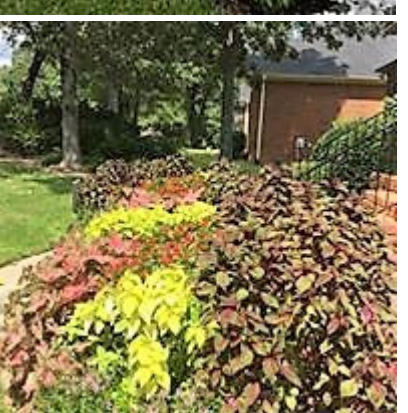
A mixed annual bed of sun coleus, dragon wing begonia, caladium and sweet potato vine at a private residence in Albertville, Ala.

To grow full, mature plants with lots of flowers, we must provide the correct nutrients, in the right amount, at the right time. When planting summer annuals after the threat of frost, it is recommended to incorporate a slowrelease fertilizer into the media. I typically recommend Harrell's 17-5-11 slow release with micronutrient. This initial fertilization provides four-to-six months of nutrients to the plant. This fertilizer will put out at a rate of 15-to-20 pounds per 1,000 square feet. About two weeks after planting, apply a liquid drench of fulvic acid and 9-3-6 liquid fertilizer. For fulvic acid. I recommend Harrell's Bio-Max Root Enhancer