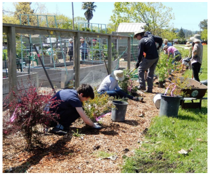
▲ Volunteers were divided into teams to plant

heavy soil, summer watering and also withstand afternoon winds. The committee selected a variety of 30 shrubs, 21 perennials and four