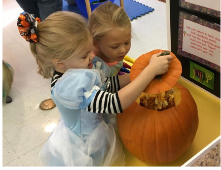
A "Discovery Table" featured a hands-on learning exhibit each day. On one day, children were invited to lift the top of the pumpkin to investigate and explore what was inside, using their senses of smell and touch. Parents also were invited to visit the classroom to view the changing exhibits.