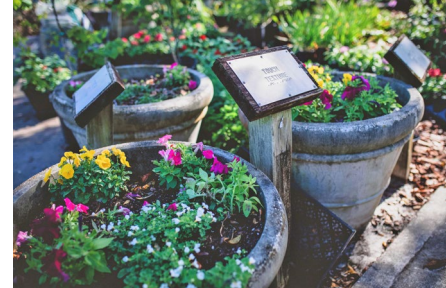
▲ The Garden Club of DeLand, Fla., designed a sensory garden in 1998 as a garden therapy project. The garden, designed for the visually impaired, offers accessible pathways for ease of navigation, and features fragrant and textural plants for tactile experiences and signage inscribed in Braille. The garden club revamped the sensory garden and recently introduced a butterfly garden into the existing space.