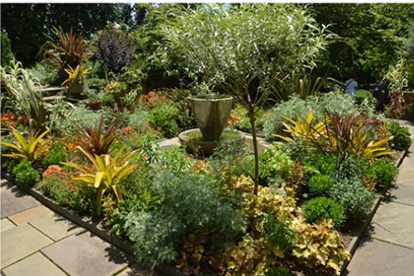
The Tea Cup Garden changes plants and colors throughout the seasons. From spring through summer and into fall, the water in the central container adds sound and sparkle to the changing horticulture.

Adolph's country show included terraces, vast lawns falling away from the house and decorative groupings of trees. The landscape