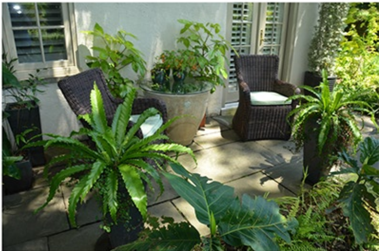
The form and arrangement of containers in a seating grouping offer an open invitation to read, relax and reflect. The many pairs of chairs scattered throughout the garden are placed for the created views and the time to appreciate them.

A very hot market at garden shops nationwide is the introduction of decorator vegetables and the reintroduction and perceived value of heirloom, antique varieties. How thrilling it would be to imagine that the mothers and grandmothers who introduced all of us to the passion of truly organic gardening would suddenly return to find the same variety of Rhubarb or Rosemary that their grandmothers had passed to them.