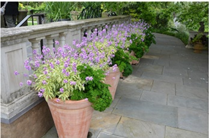
A linear display of similar containers features edible herbs and high-color annuals.

same ELEMENTS of art that apply to the Elgin Marbles, in the British Museum, the Mona Lisa, in the Louvre, a fugue by Bach played by the Boston Symphony or a Tiffany Wisteria lamp exhibited at the Met should be used to assess the beauty and the value of the living exhibits in the Rooster's Garden.