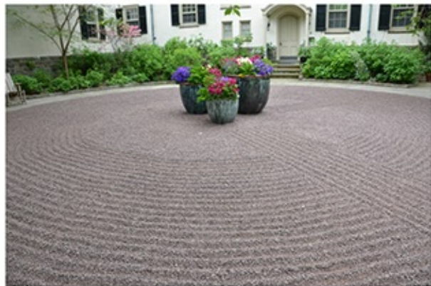
The raked gravel of the driveway always showcases a collection of containers. The centerpiece and its isolation always focuses attention on the beauty of the plants.

The artistic merging of the next three elements can be a trifecta in the creation of a winning container. At Chanticleer, FORM, TEXTURE and MASS are major thirds in a musical chord of container design. In selecting a pot, consider not