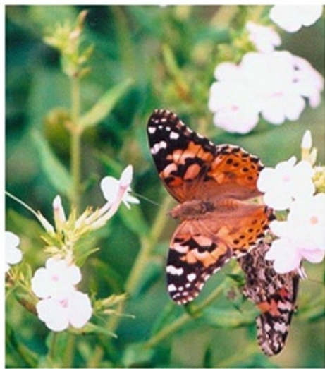
The Painted Lady is one butterfly that's found in all 50 states.

As gardeners, we can make a difference by planting for butterflies. We have two Butterfly Gardens, and have the Monarch's host plant, milkweed, but we haven't seen a lot of butterflies as of this writing. I'll be anxious to see if the Painted Lady pays us a visit when the Purple Coneflower is in bloom. You can plant an area for butterflies, either in your yard or help with an area in a local park. Plant host plants to attract butterflies, keep watch to see what butterflies visit the area, and then add their host plants to the area next spring. If anyone needs seed for common milkweed, A. syriaca , send me a note either by email or regular mail and I'll see that you receive some to drop in the ground this fall.