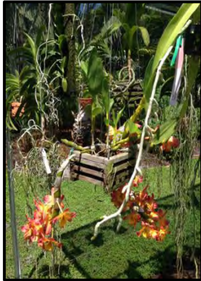
Private Residence Winner