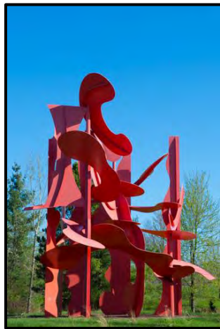
Sculpture by Louise Nevelson Frederik Meijer Gardens & Sculpture Park, Grand Rapids, MI.