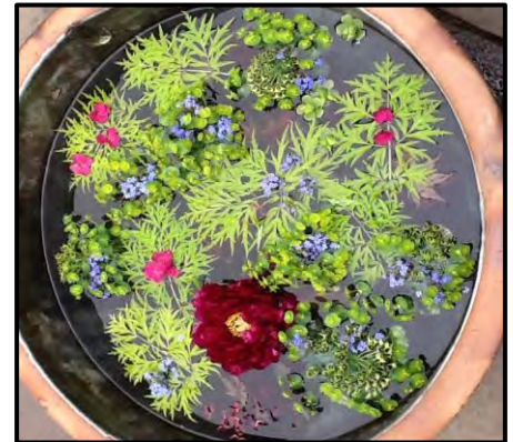
Floral arrangement in water, Chanticleer Garden, Wayne, PA.