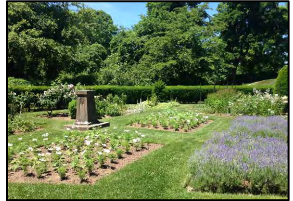
Sunken Garden at Hill-Stead Museum, Farmington, CT, designed by Beatrix Farrand.