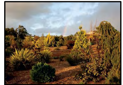
Colorful conifers for fall and winter appeal.

The gardens at Circle Oak Ranch demonstrate good land use and are irrigated almost exclusively with in-line tubing. The use of different planting techniques allows plants with different water needs to live harmoniously. The soil is primarily adobe and many of the plantings are on mounds constructed of 1/3 native soil, 1/3 amended loam and 1/3 ¼” lava pebbles.