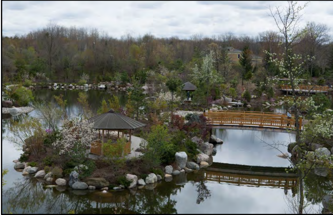
Richard & Helen DeVos Japanese Garden at Frederik Meijer Gardens & Sculpture Park, Grand Rapids, Michigan.