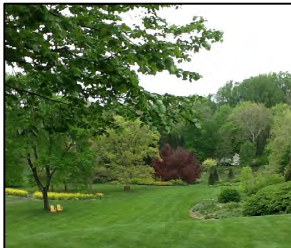
View from porch, Chanticleer, Wayne, PA.

PLEASE consult our website for the latest information on schools and refreshers: www.gardenclub.org