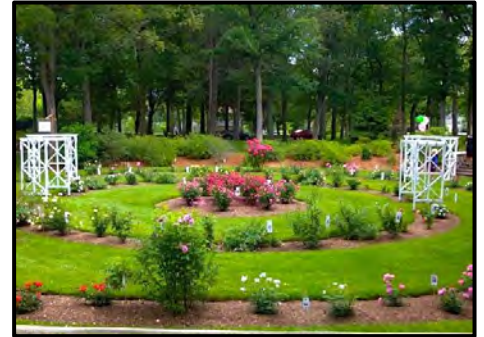
June 2015: Completed garden planted over three years. Bushes are young and will fill in vacant spaces.

barren field of scrubland and stumps. Attleboro Garden Club offered to revitalize the 60-year-old Anderson Rose Garden as a gift to the city for the park's 100th anniversary in 2014.