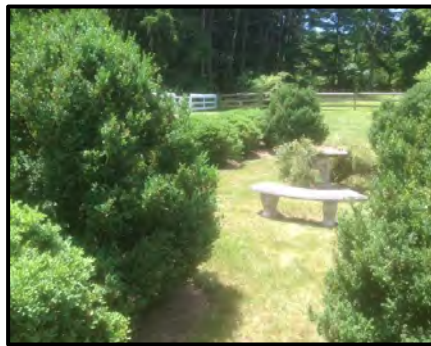
Caron's boxwood garden.