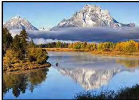
Grand Teton National Park

Per Stewards , Frederick Law Olmsted, considered the father of American Landscape Architecture, “believed in the therapeutic qualities of the landscape and sought to provide parks as a means to escape the crowded and polluted conditions of nineteenth century cities.” He was “an advocate for the preservation of natural resources and scenery...he was a tireless proponent of policies that would create a system of national parks...he is generally credited with...creating the foundation on which the current National Park Service is based.”