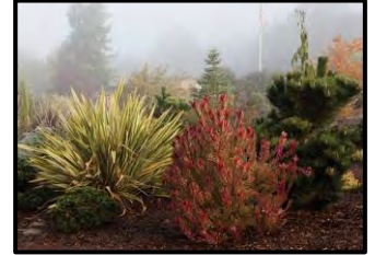
Colors on a foggy winter morning

The gardens at Circle Oak Ranch demonstrate good land use and are irrigated almost exclusively with in-line tubing. The use of different planting techniques allows plants with different water needs to live harmoniously. The soil is primarily adobe and many of the plantings are on mounds constructed of 1/3 native soil, 1/3 amended loam and 1/3 ¼” lava pebbles.