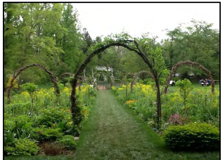
Cutting Garden at Chanticleer Garden, Wayne, PA.