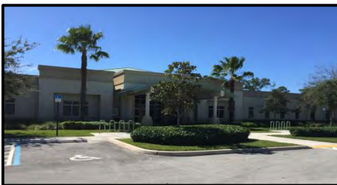
Public Facility Winner: Greenacres City Hall, Greenacres, FL.

LD Consultant & District X Landscape Design Award Chairperson