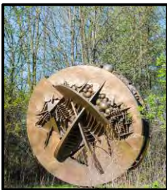
Sculpture by Arnaldo Pomodoro Meijer Sculpture Park.