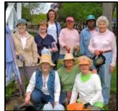
Happy garden club members after planting the outer ring in 2015.

The project was completed over three years, beginning in 2012. Garden club members and city employees worked together on the project and will continue the partnership to maintain the garden. When they started, the garden was sparse, with an inappropriate selection of plants and an overhead watering system that contributed to disease and weak plants.