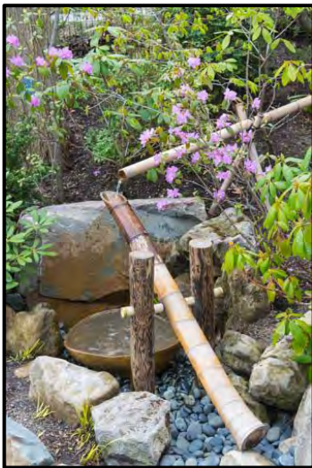
Water Feature, Japanese Garden