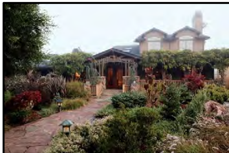
Entrance to Sara Malone’s garden and home in Petaluma

An application for the California Consultants’ Council award was received honoring Sara Malone in East Petaluma. Since 1997, Sara has developed a unique style of gardening that emphasizes the use of shrubs and trees rather than herbaceous perennials. The gardens at Circle Oak Ranch primarily feature woody plants: both shrubs and trees, deciduous and evergreen, broad-leaved and conifer. Plants selected produce four seasons of color, texture and structure. Rather than relying on flowers for beauty and interest, focal points are colorful ornate cones, textured bark and berries.