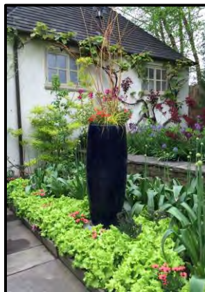
Kitchen Garden at Chanticleer

Among these are the Chanticleer terraces on the south side of the mansion that was built in 1912. In the summer months, a lot of tropicals and very lush flowering containers are on display. Another garden is the pond area, which seems to be a cross between a meadow and a perennial border.