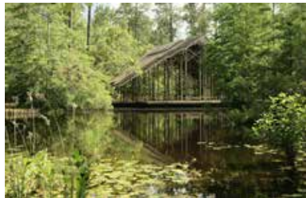
▲ The Pinecote Pavilion is a popular starting point for nature walks at The Crosby Arboretum. The pavilion was designed by architect E. Fay Jones, an apprentice of renowned architect Frank Lloyd Wright.

The Crosby Arboretum is the premier native plant conservatory in the Southeast and a valuable resource for education in the region and world. Situated on over 700 acres of natural areas that shelter over 300 species of indigenous trees and shrubs, the Crosby Arboretum also includes a 64-acre interpretive center. It provides for the protection of the region's biological diversity, as well as a place for the public's enjoyment of plant species native to the Pearl River Basin watershed of Southern Mississippi. A box lunch and beverage is included.