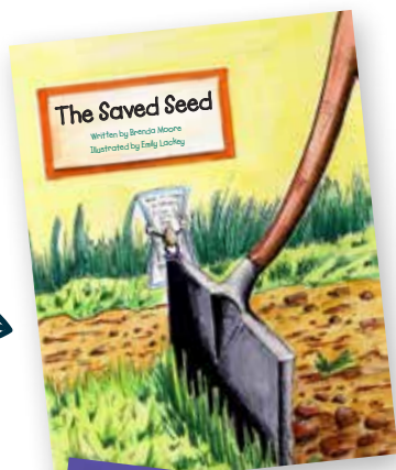
THE SAVED SEED & FRIGHTENED FROG BOOKS