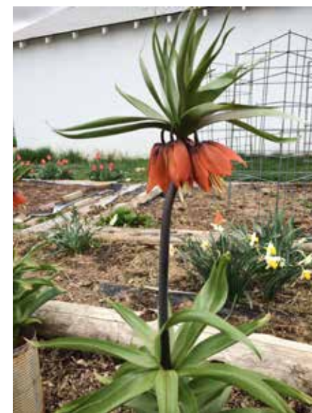
▲ TOP: Dinosaur Kale BOTTOM: Crown Imperial