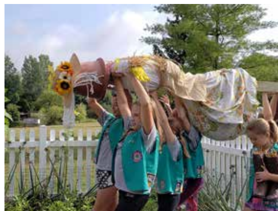
THE GIRL SCOUTS MADE A SCARE CROW FOR THE GARDEN

The Backdoor Gardeners worked with the community at the Village's Blue and Grey Days, an event that highlighted 19th century activities and featured a Civil War reenactment by the 7th Regiment Michigan Volunteer Infantry Company B. Teens, outfitted in clothing appropriate to the period, fed participants vegetables harvested from the gardens and prepared over a campfire.