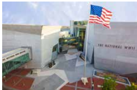
▲ The acclaimed National World War II Museum in New Orleans, La., tells the story of the American experience in a war that changed the world. It features immersive exhibits and multimedia experiences in narratives filled with compelling personal stories.

A guided tour of a "haunted" cemetery in New Orleans, La., starts off this tour.