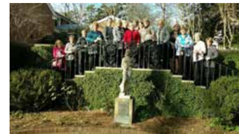
Members of the NGC 2015-2017 Executive Committee visited the Founders Memorial Garden in 2017.

of Environment and Design at UGA, and serve as a teaching resource and public garden for all campus users and visitors.