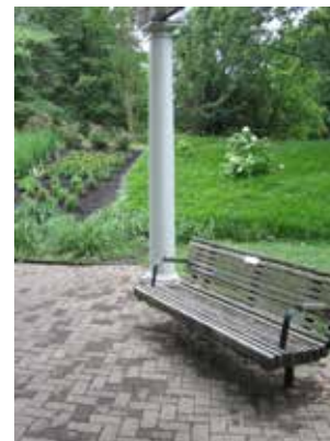
◀ Benches honoring outstanding FGCM District II directors and members were placed throughout the garden.

Notable landmarks situated throughout the garden honor past directors and members of The Federated Garden Clubs of Maryland Inc., District II. The district provides continued support for the garden through monetary contributions via fundraisers, as well as volunteer services throughout the year.