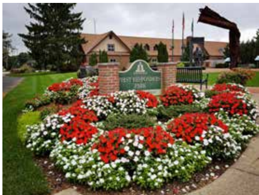
▲ Members of Westerville Garden Club maintain flower beds at First Responders Park. Dedicated in 2010, the park's centerpiece is C-40, a section of steel extracted from the rubble of the north tower of the World Trade Center, which collapsed as a result of the 9/11 attacks in New York City. The park also features "The Crossing," a sculpture that honors a fallen Westerville firefighter.

In July, 2018, the WesterFlora tour featured stops at 14 gardens, which included the residences of three Westerville Garden Club members. Also on the tour was the city's First Responders Park, which was created as a lasting memorial space to recognize and honor the service and sacrifice of