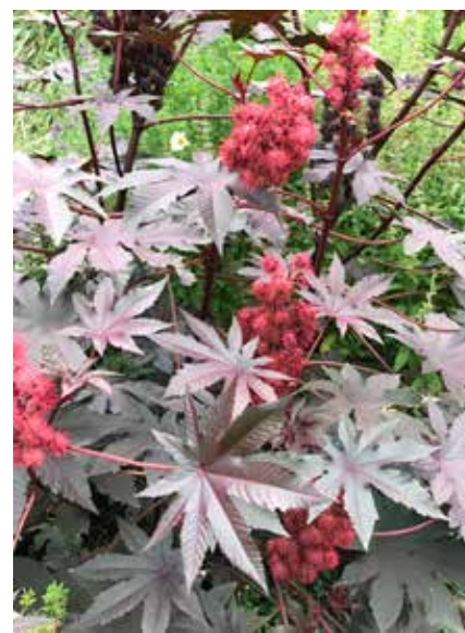
▲ Red leaf castor bean